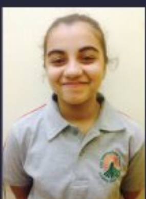
By- Aaliyah Bukhary (VII A)